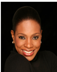
Sheryl Lee Ralph Founding Director, Island Girl Productions