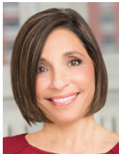
Linda Yaccarino Chairman, Advertising Sales and Client Partnerships, NBCUniversal