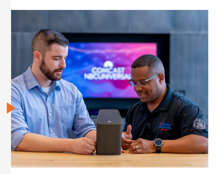
Comcast currently has thousands of military employees across the country who have translated their valuable experiences in the armed forces to our workforce

Sky: Sky's loyalty program, which rewards customer tenure, is now available in all markets after launching in Germany