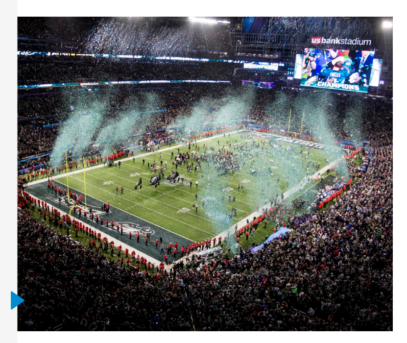
The game achieves a total audience delivery of more than 118 million viewers

NBC: Super Bowl LII on NBC is the most watched show of the year and ranks as a top 10 show in US television history