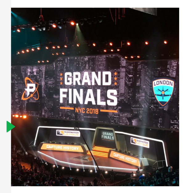
The match was played at a sold-out Barclays Center in Brooklyn, New York

Corporate: Comcast NBCUniversal is named one of PEOPLE Magazine's '50 Companies That Care'