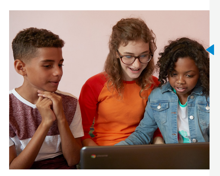
The program is now available to nearly 1 million low-income veterans who live within the Comcast footprint