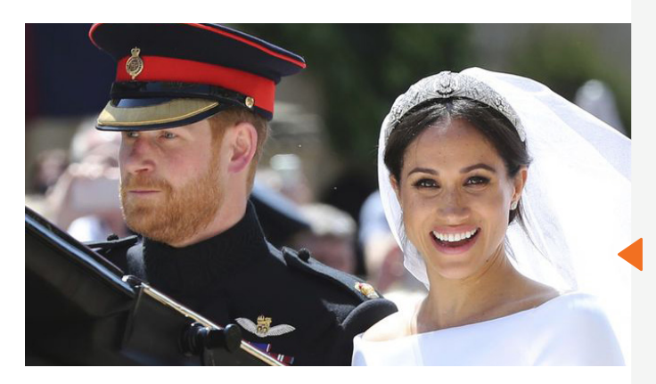
Sky uses world-first technology on its app to allow users to identify guests via facial recognition software