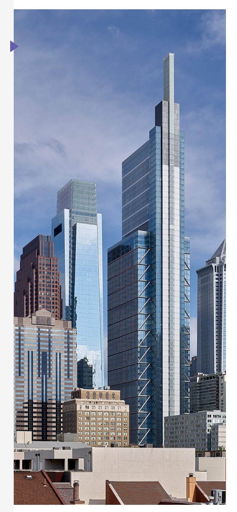
The Company expands its vertical campus and welcomes 4,000 technologists, engineers, and software architects to their new home

Telemundo: Telemundo wins the broadcast season in weekday prime for the second consecutive year