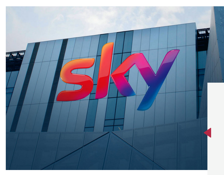
Comcast counts a total of 54 million direct customer relationships, nearly 200 million homes in our service footprints, and nearly 200,000 employees worldwide