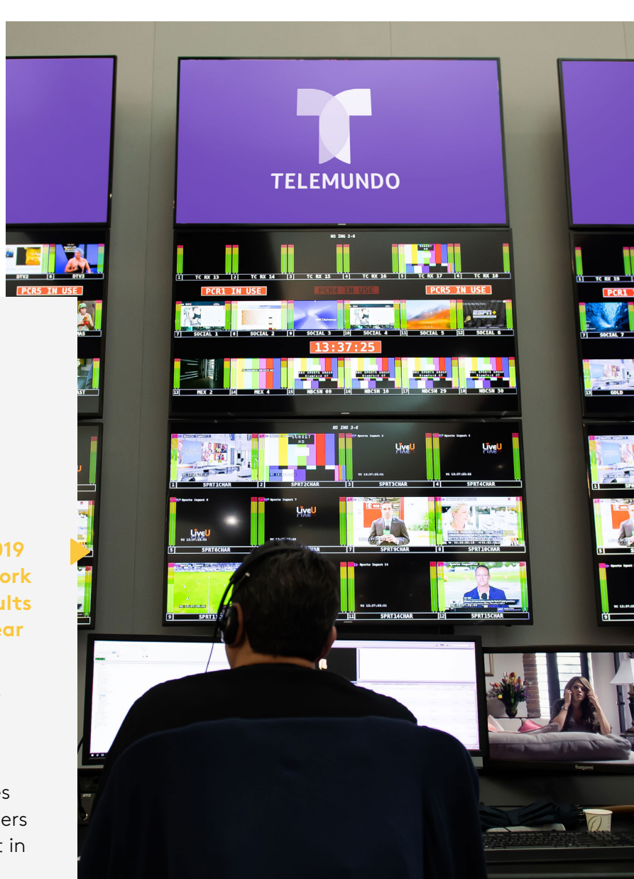
For the first time in the network's history, Telemundo also outperformed Univision in general market primetime among adults 18-34.