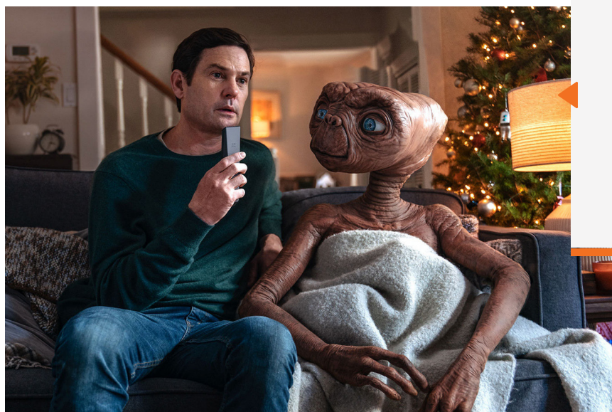
A reunion three million light years in the making.

Xfinity: A cross company effort reunites beloved characters – E.T. and Elliott – for a holiday short story receiving more than 200 million views