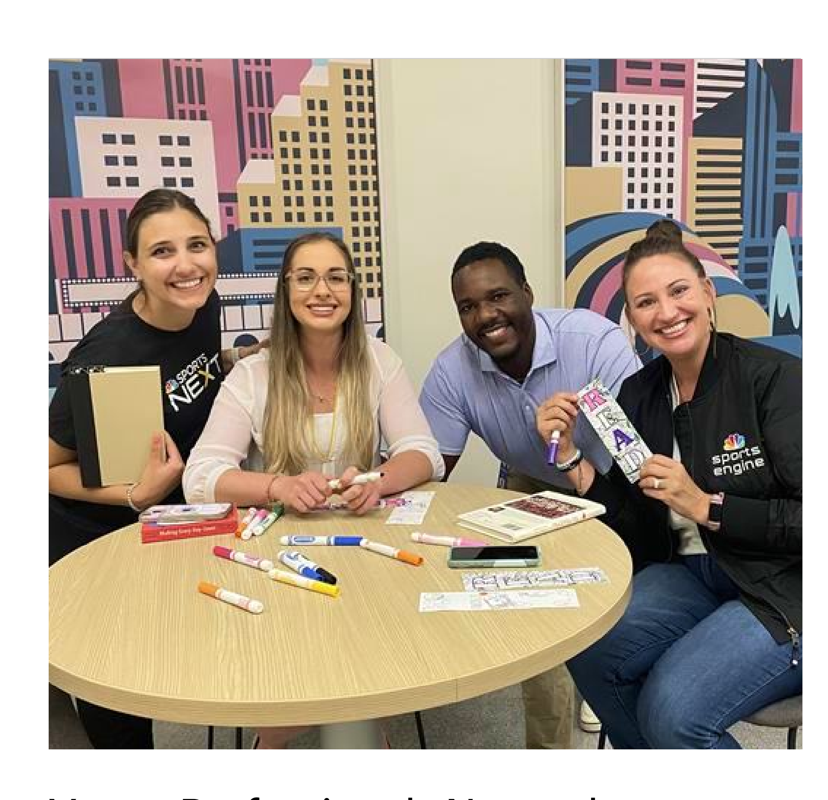
Young Professionals Network