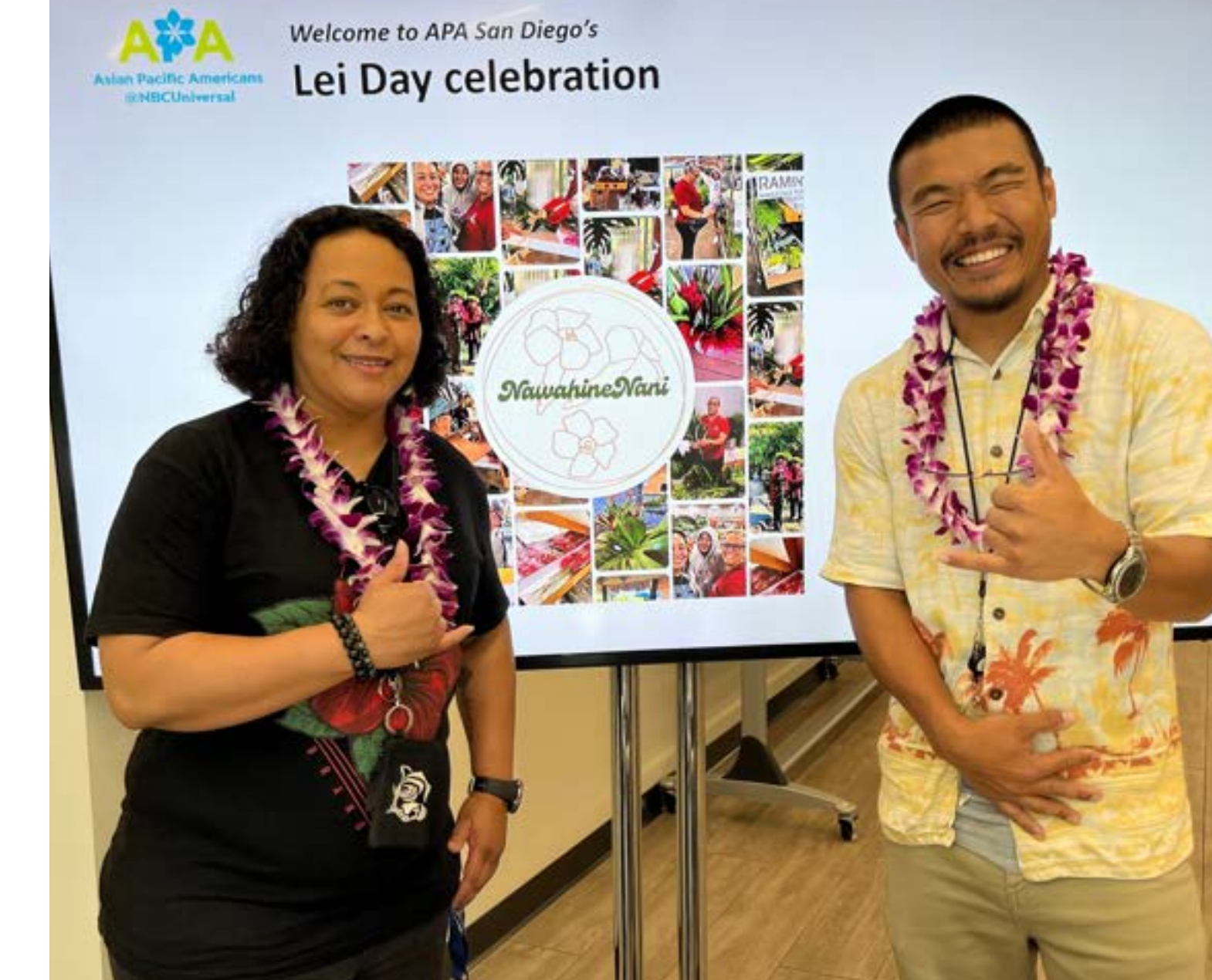
Asian Pacific Americans